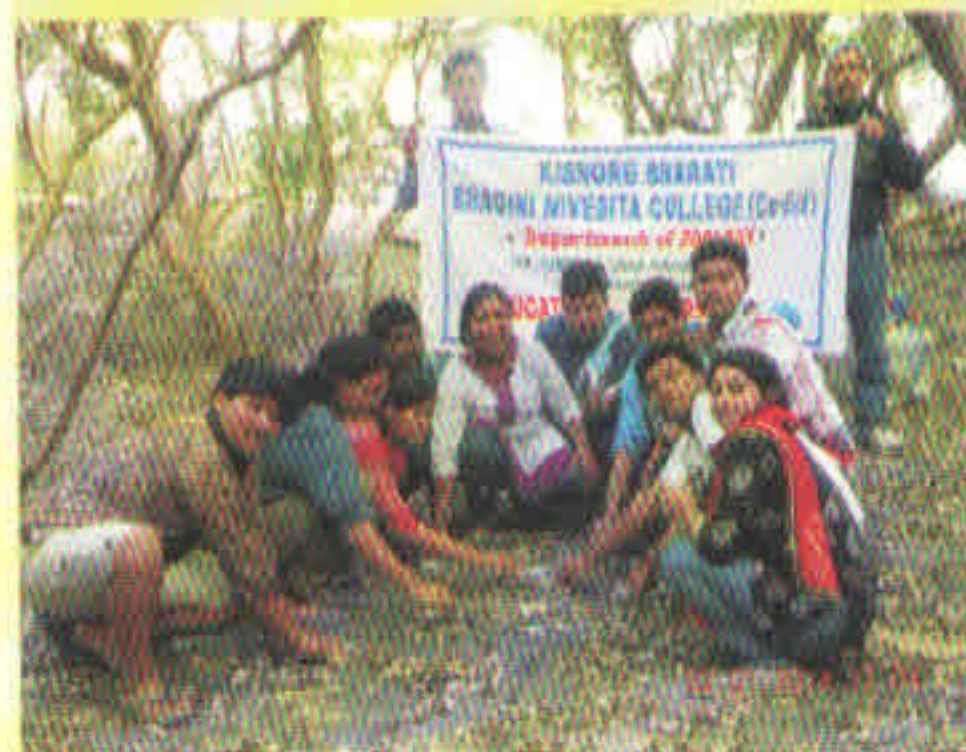
Educational Excursion - Dept. of Zoology