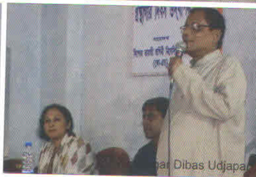
Granthagar Dibas Udjapan