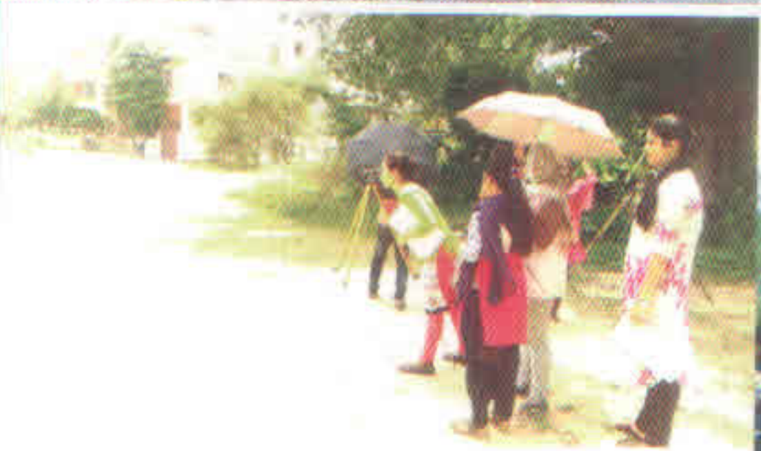
Instrumental Survey (Dept. of Geography)