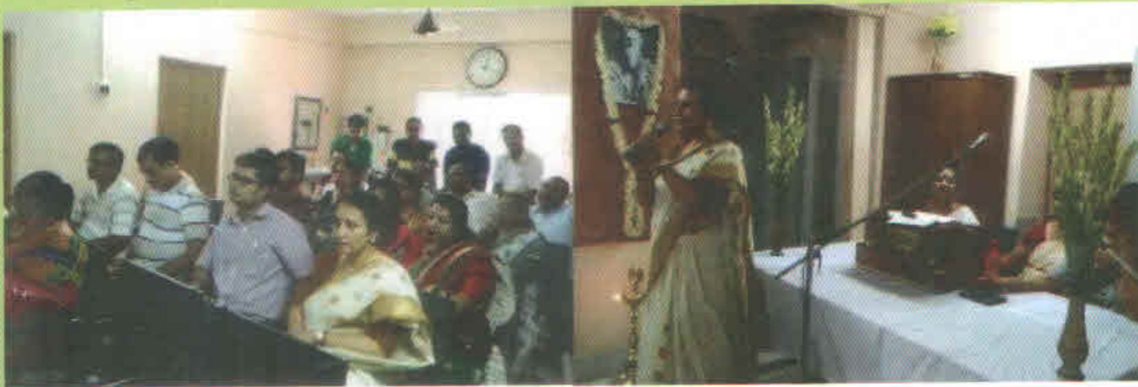
Rabindra Jayanti Celebration