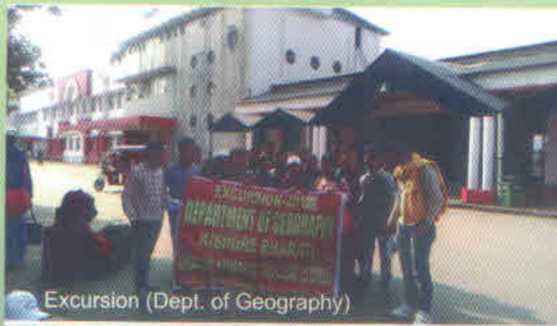
Excursion (Dept. of Geography)