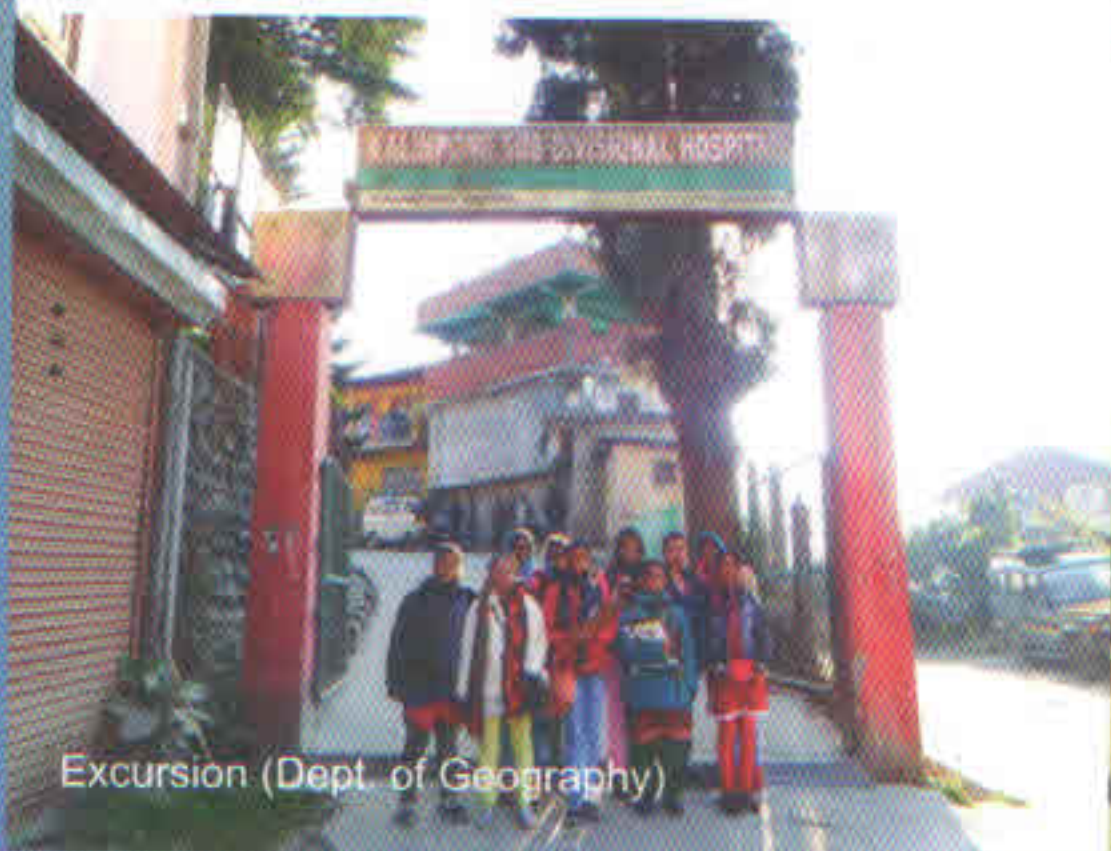
Excursion (Dept. of Geography)