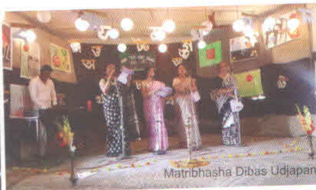
Matribhasha Dibas Udjapan