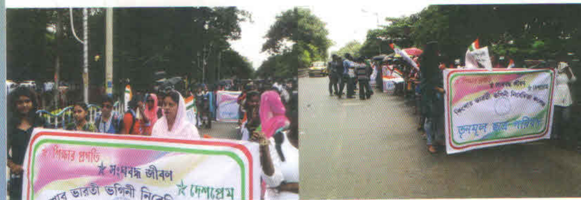
Student's Union Activities