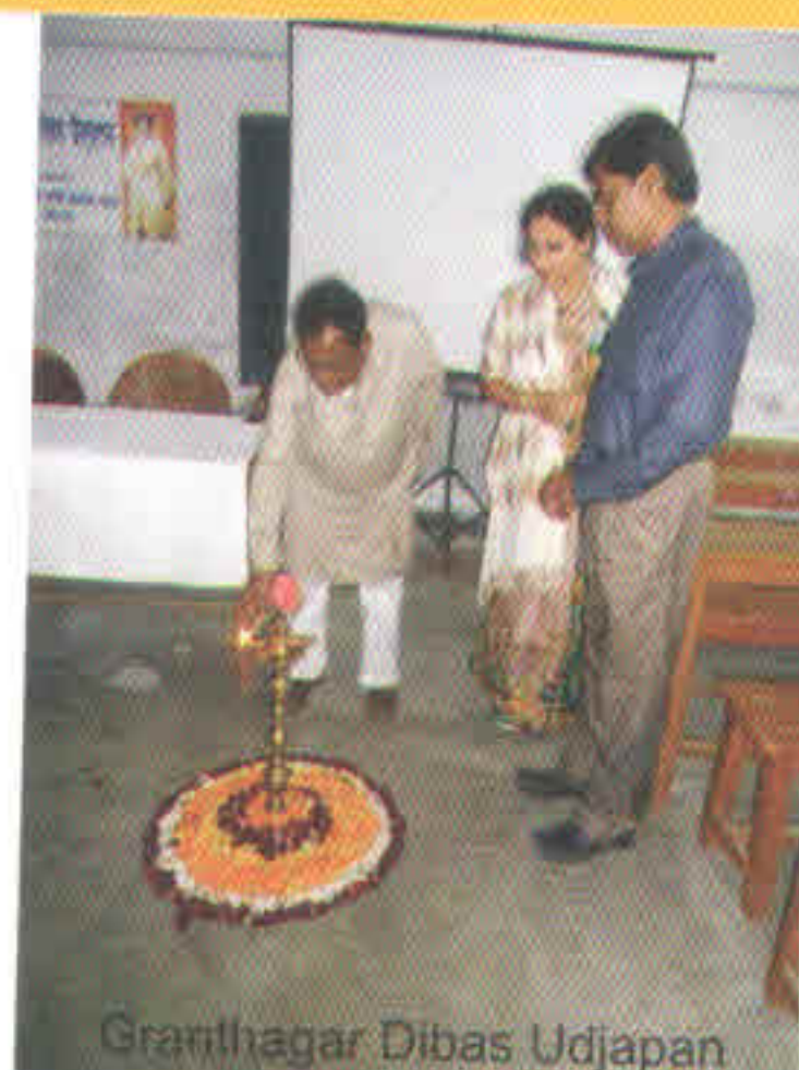
Granthagar Dibas Udjapan

11.00 A.M. to 1.00 P.M. & 2.00 P.M. to 4.00 P.M.