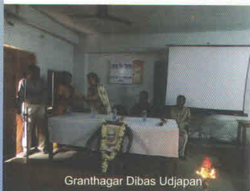
Granthagar Dibas Udjapan