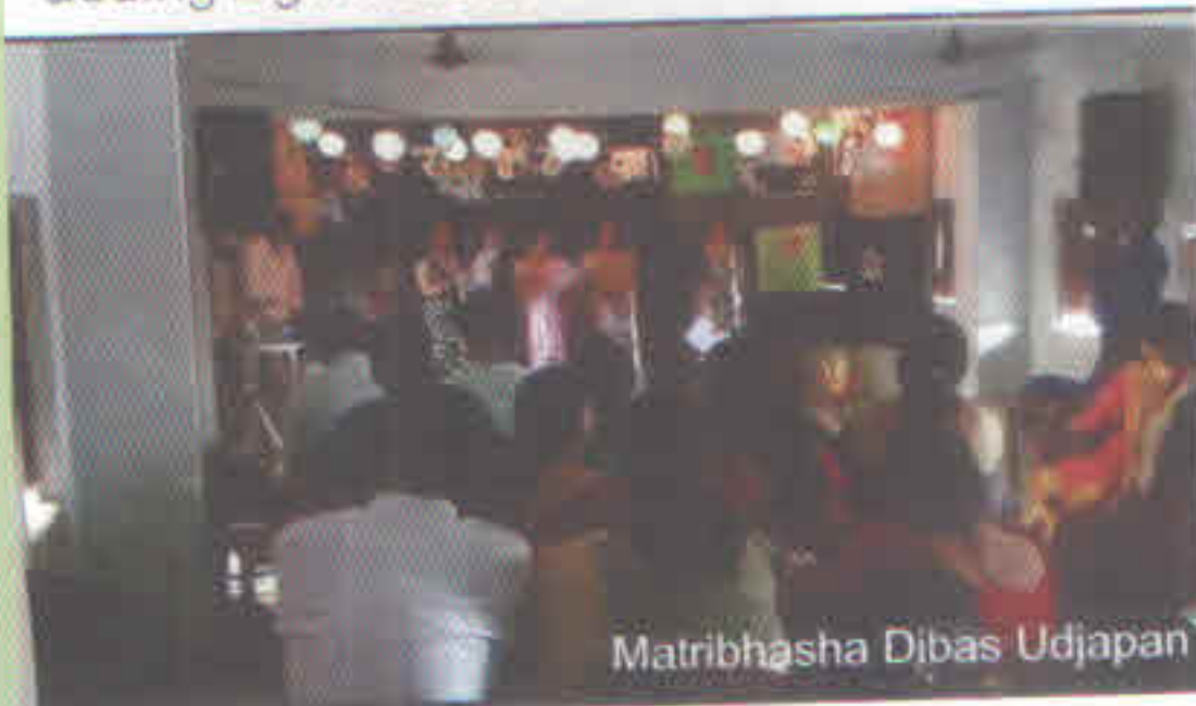
Matribhasha Dibas Udjapan

Matribhasha Dibas or International Mother Tongue Day is celebrated on 21st February every year with a lot of fervour and dedication. Usually orchestrated by the Bengali department over the years, the Committee which is at the helm of its organisation also does a very good job of adding a glamorous effect to the entire do.