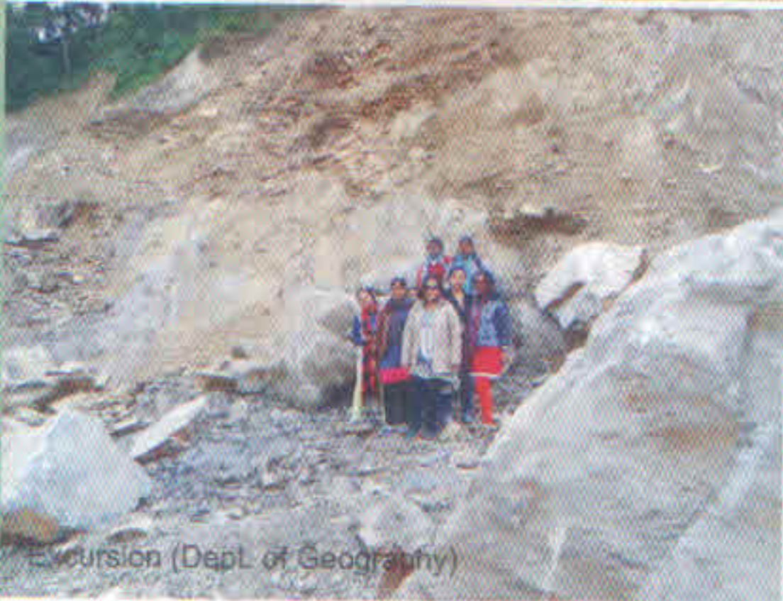
Excursion (Dept. of Geography)