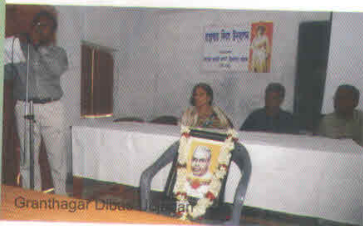
Granthagar Dibas Udjapan