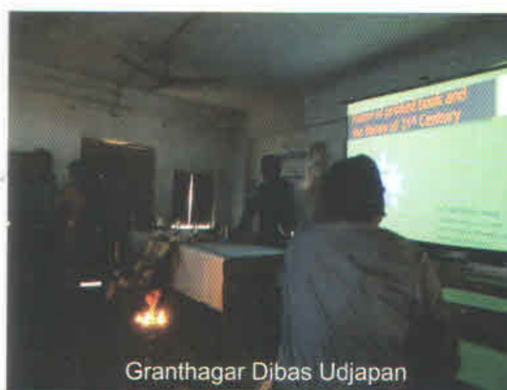
Granthagar Dibas Udjapan