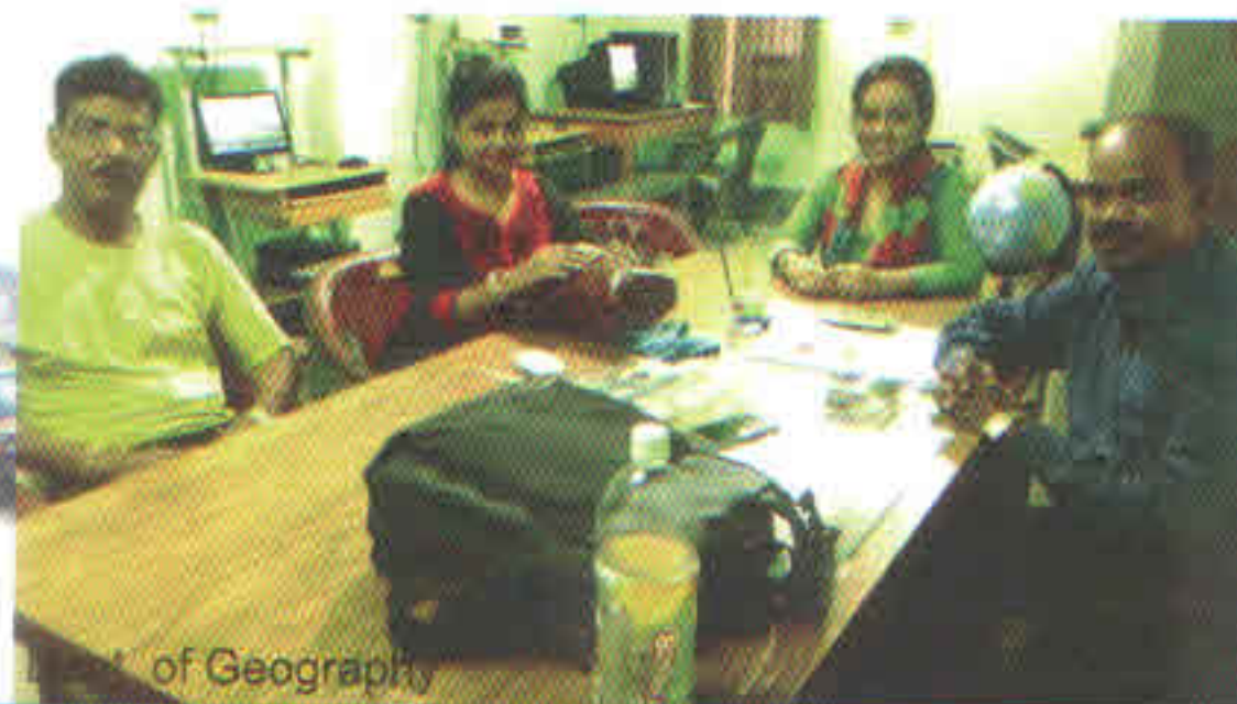
Dept. of Geography