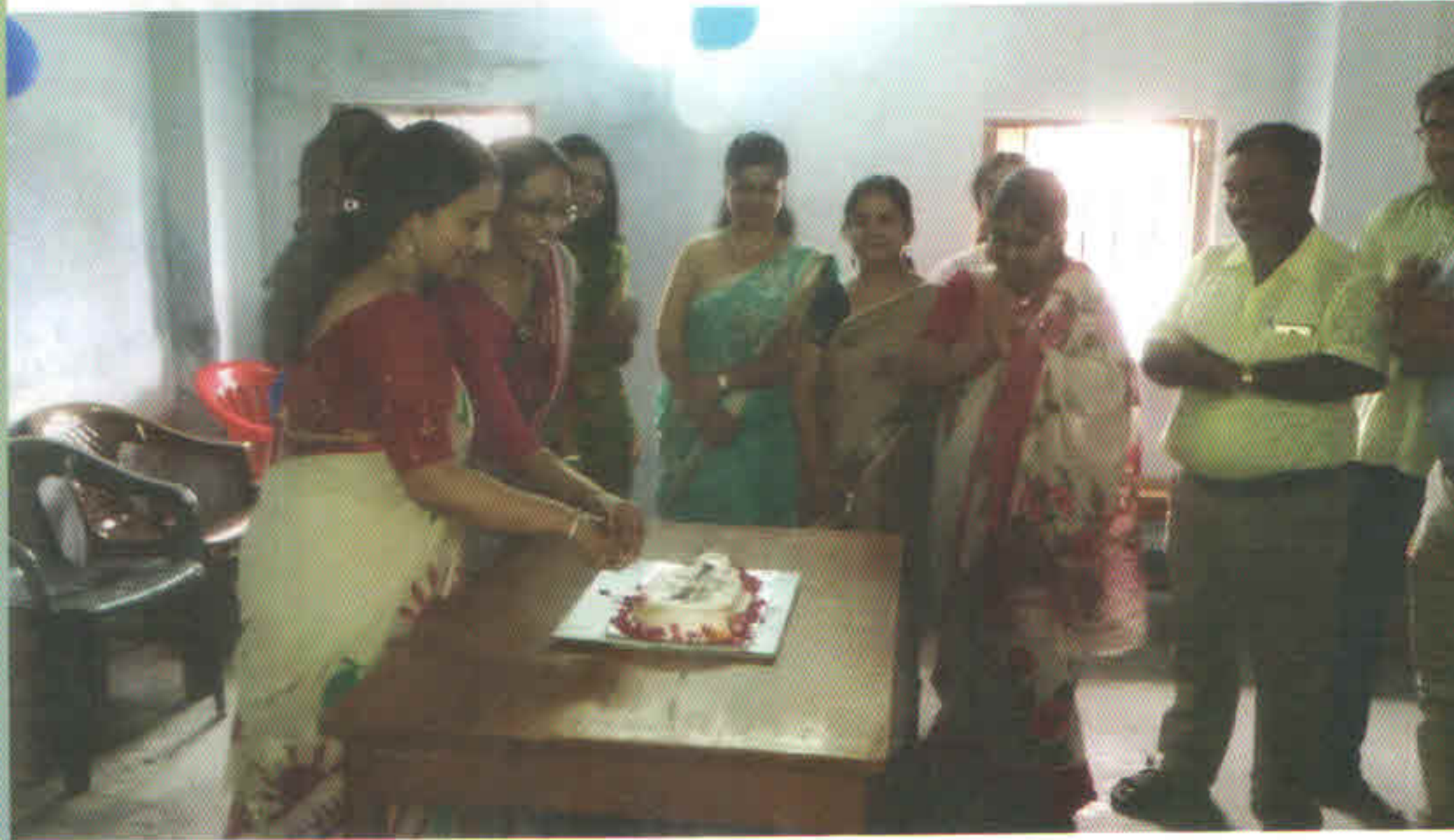
Teacher's Day Celebration