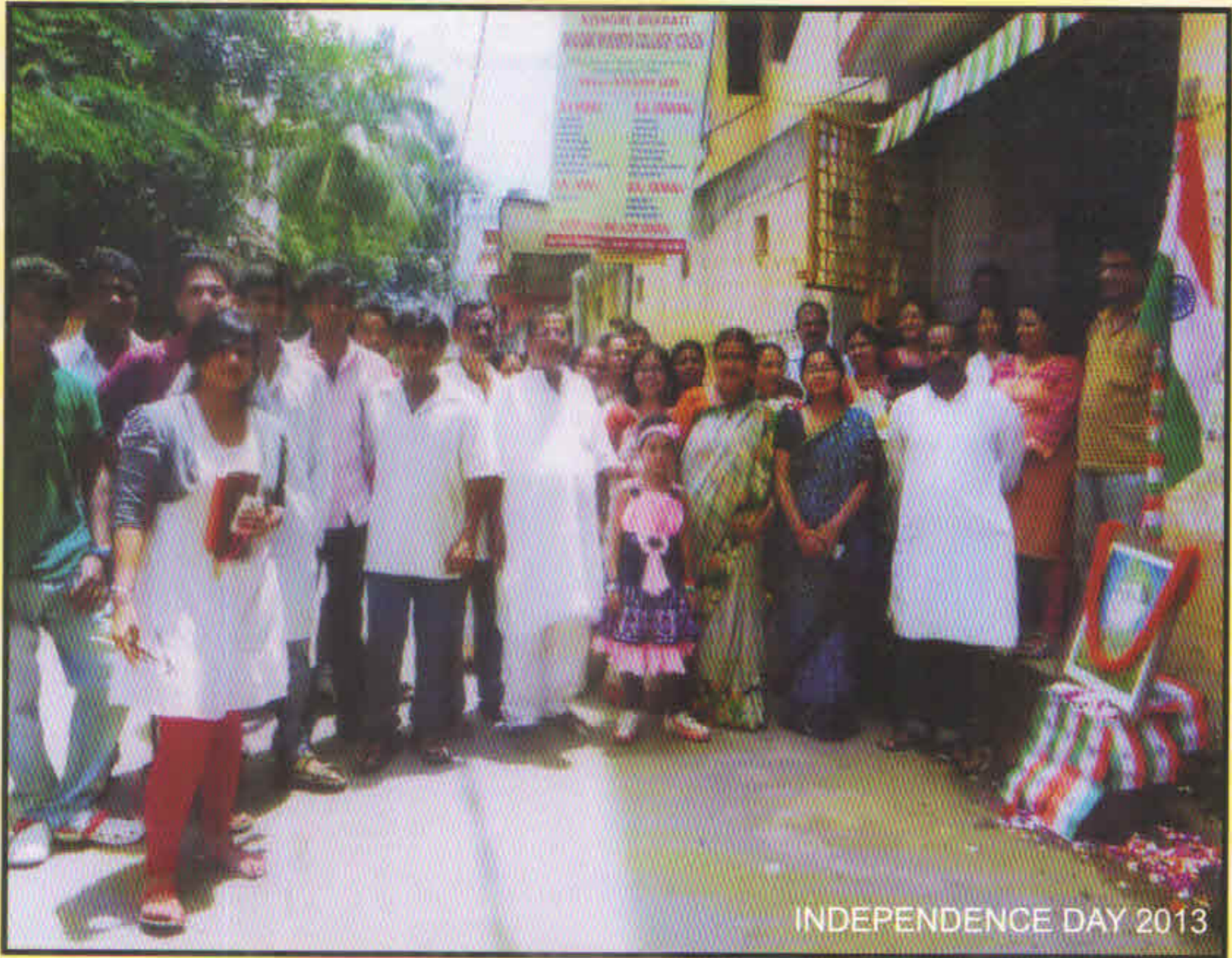
INDEPENDENCE DAY 2013