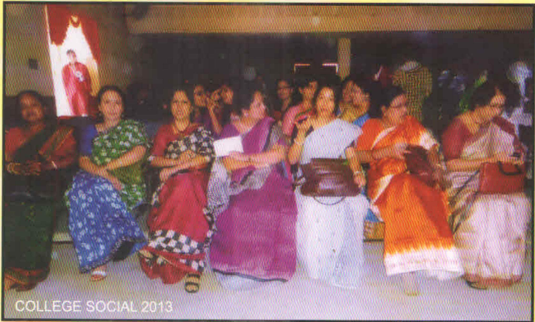
COLLEGE SOCIAL 2013