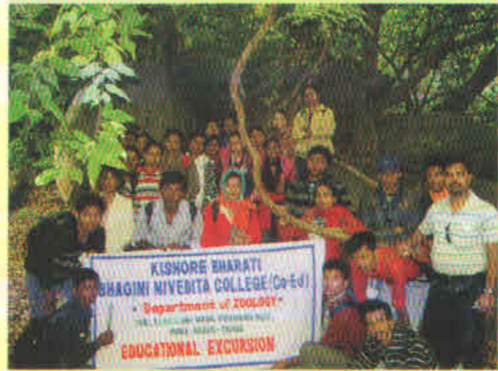
Educational Excursion-2013 Dept. of Zoology