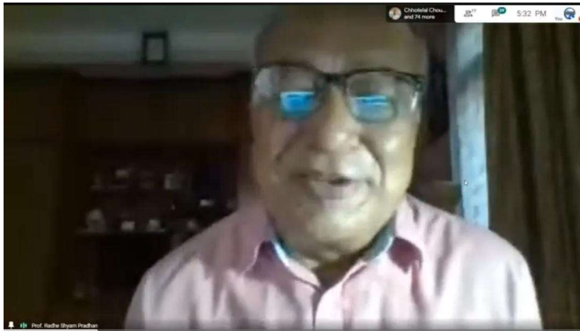
International Webinar on "Impact of Covid - 19 Pandemic and Lockdown on Industry, ..."