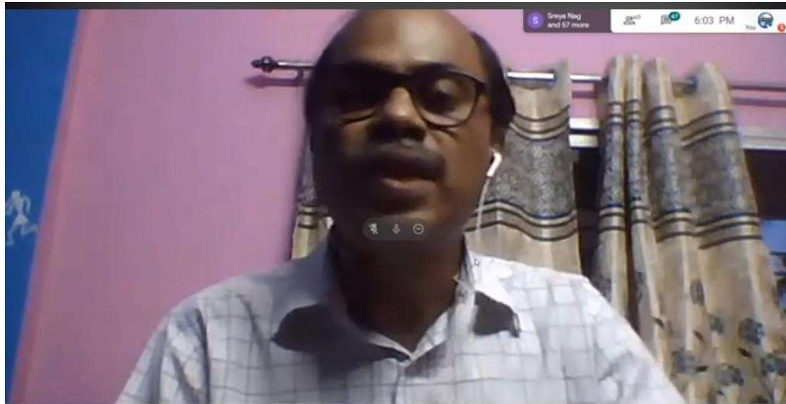
International Webinar on "Impact of Covid - 19 Pandemic and Lockdown on Industry, ..."